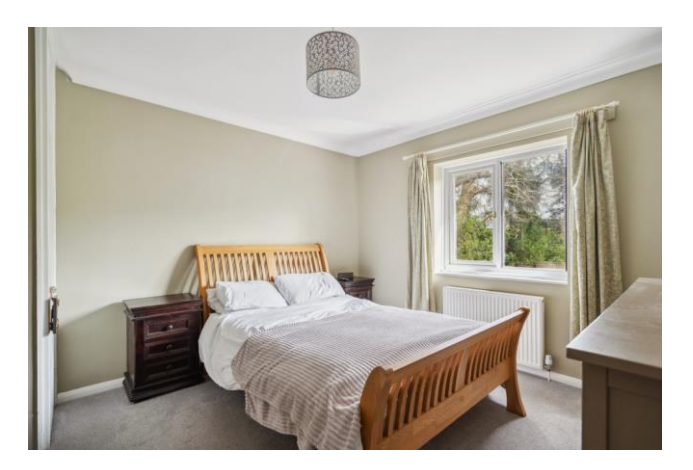
BEDROOM (REAR RIGHT) double glazed window overlooking the garden, radiator, coved ceiling and built in wardrobe.

LANDING with built in linen cupboard, access to loft, coved ceiling.