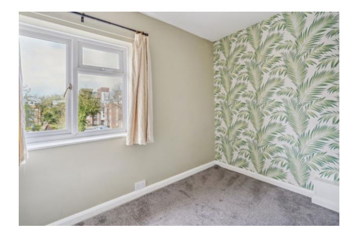
BEDROOM (FRONT RIGHT) double glazed window, radiator, built in wardrobe.