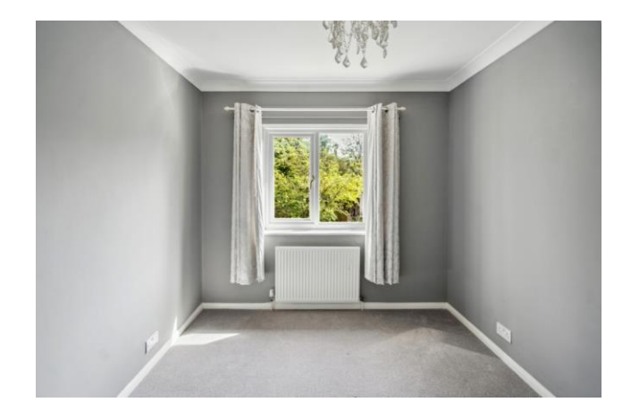
BEDROOM (REAR LEFT) built in wardrobe, double glazed window overlooking the rear garden, radiator, coved ceiling.